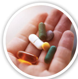
PRESCRIPTIONS & SUPPLEMENTS