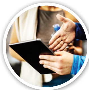
PERSONALIZED PERFORMANCE PLANS